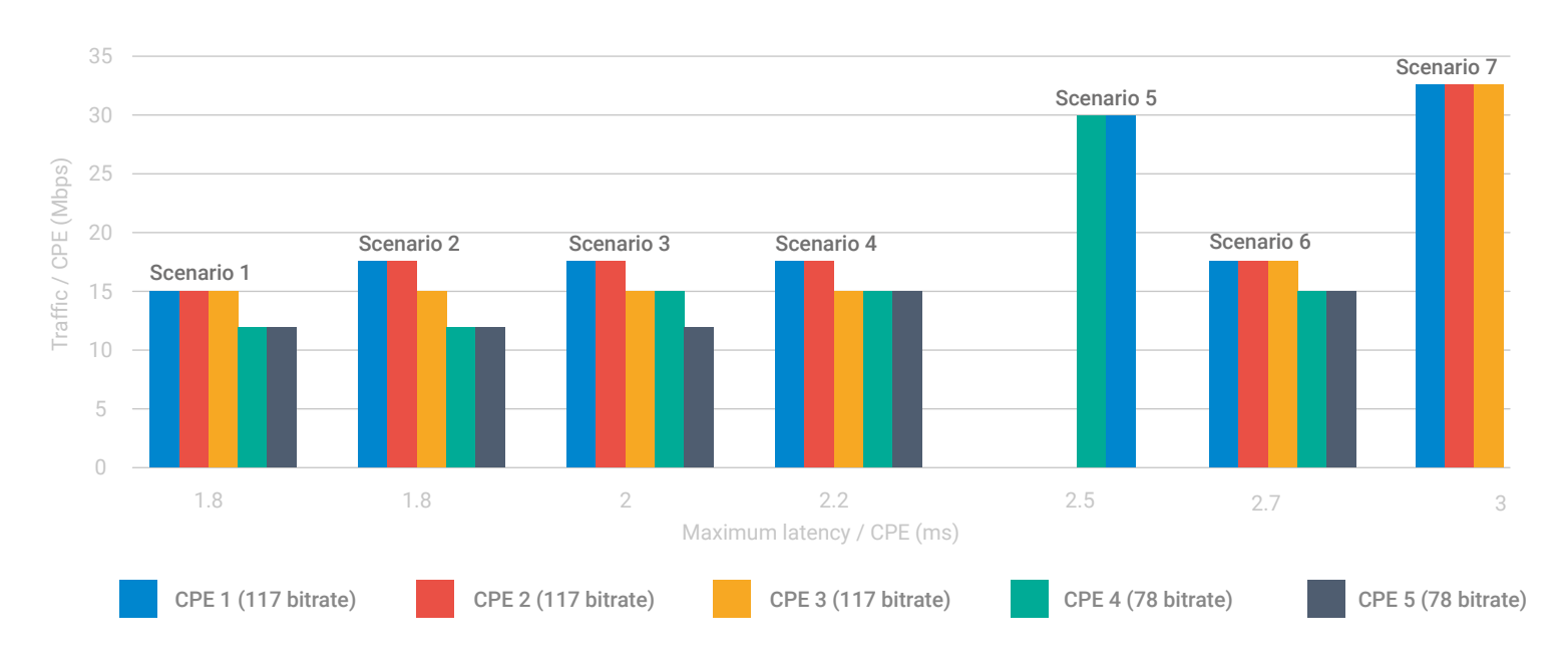
Figure 2 Latency variation with the traffic growth

Although the latency values have a slight increasing trend with the traffic load increase from one scenario to another, they remain very low overall. The graph below is a visual representation of the values in the table, taking into consideration the maximum latency values for each scenario (each row of the table):